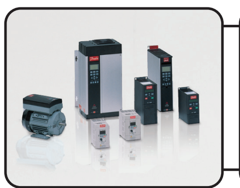
Adjustable Frequency Drives