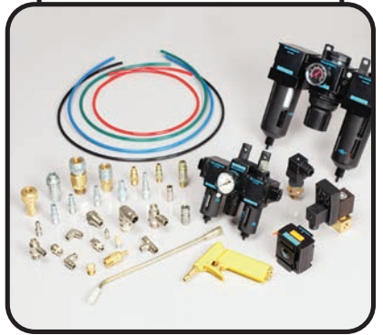
Complete Air Preparation & Accessories